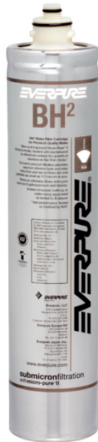
BH 2 Replacement Cartridge: EV9612-50